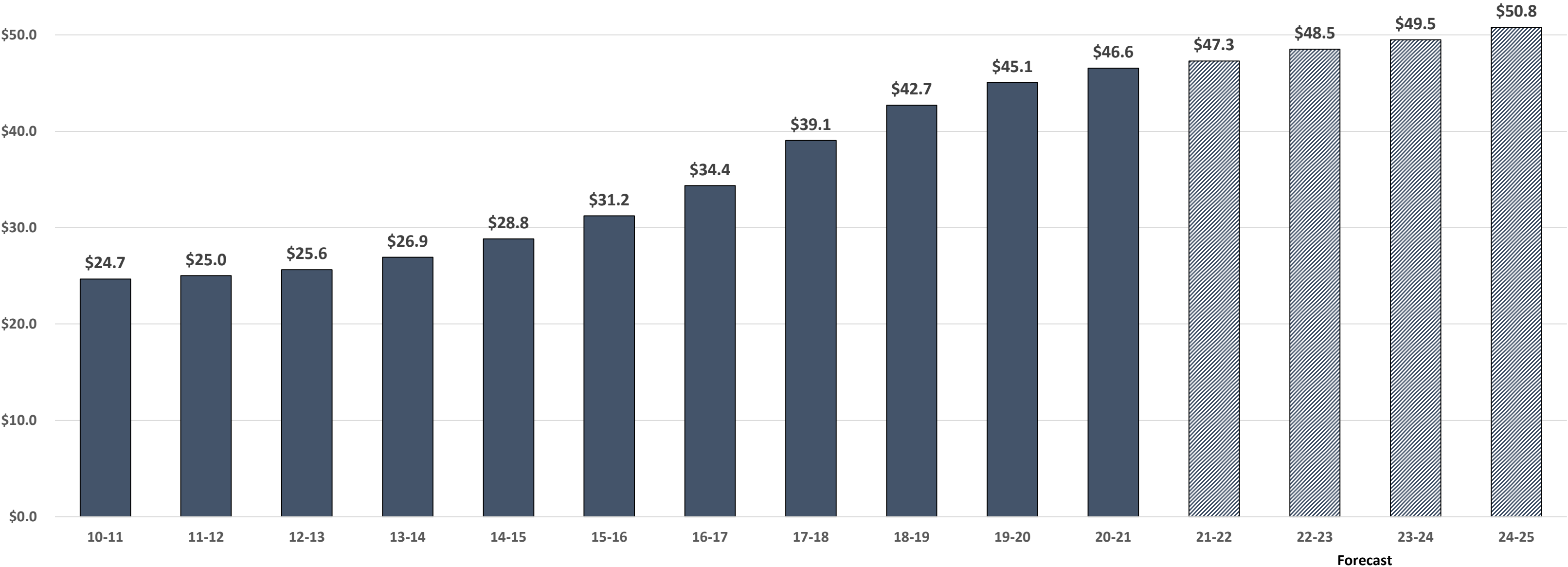
City of Plano Property Tax Base in $ Billions