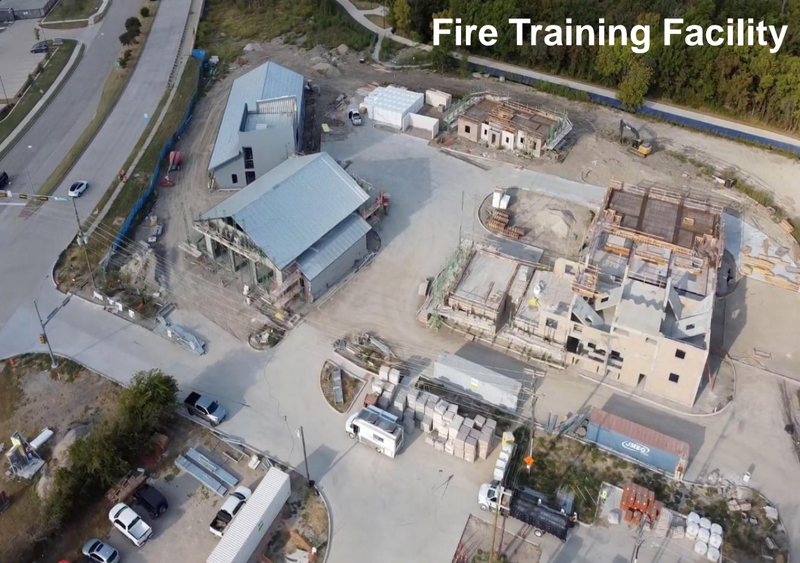
Fire Training Facility