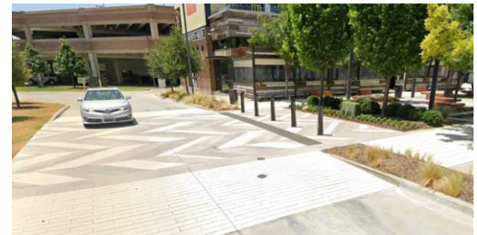
Raised Table Crosswalk